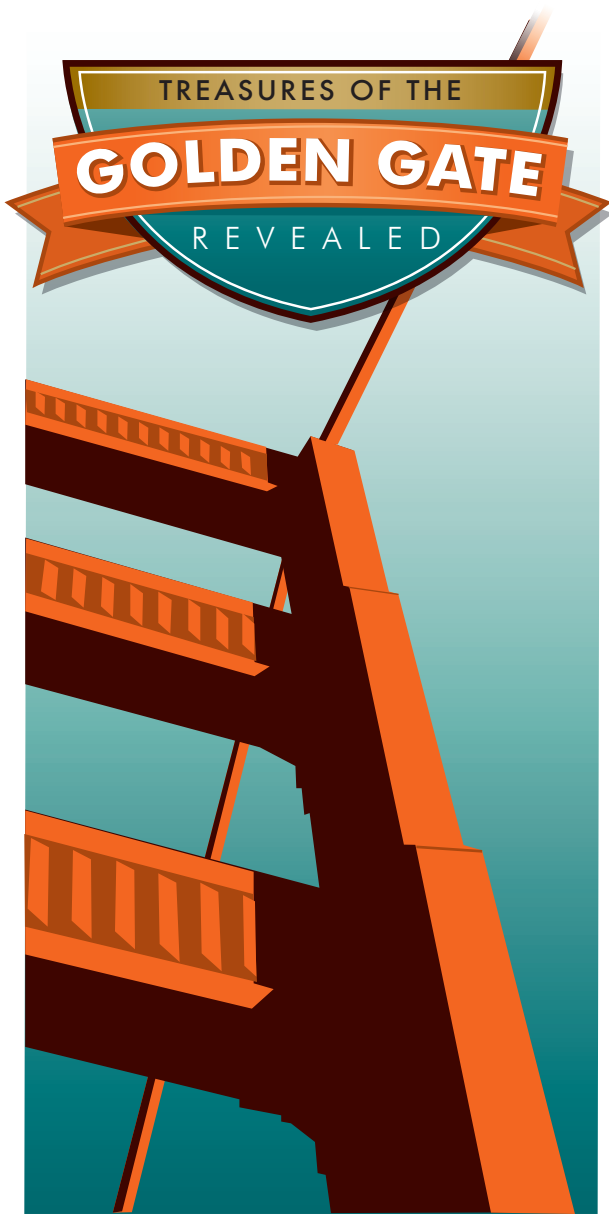
Discover Fascinating Facts and History While Walking the Golden Gate Bridge